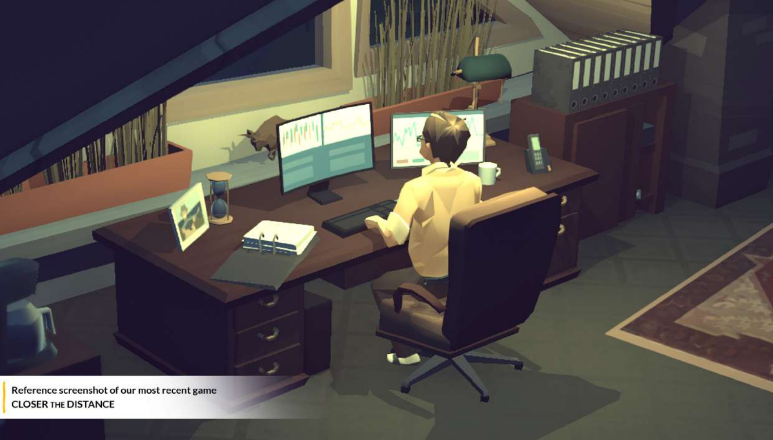
Reference screenshot of our most recent game CLOSER THE DISTANCE